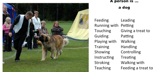
Figure 2: Many different ways to describe an action in an image

Splitting training and test set For each object in our human action dataset, we split half of the images for training and the other half is used for testing. The splitting process is done such that actions that occur in test set also occur in training set to guarantee that the training set contains at least one image for each action occurring in the test set.