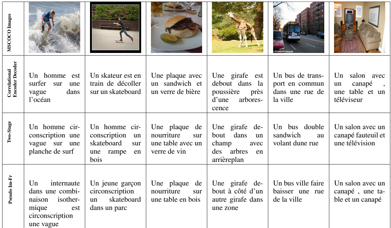
Table 4: Example captions generated by the three methods on a sample set of MSCOCO test images

the English captions into French (using IBM's translation system).