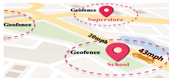
Figure 2: Geo-fencing around sensitive areas

We use geofencing (illustrated in Figure 2) to identify regions near schools and other sensitive or crowded areas (e.g., shopping malls, hospitals). We highlight to drivers unsafe driving within a geofenced area as it is more likely to result in incidents in these areas compared to less crowded places. For example, in addition to tell the driver that s/he was speeding, the enhanced feedback add a message that the speeding happened near a school