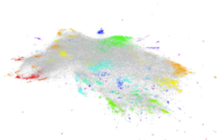
Figure 1: HDBSCAN clusters of the SBERT-NLI-STSB-base representations of r/CoronavirusWA posts made at 50 dimensions but reduced to 2 for visualisation.

Many papers have shown that web search data can be used to forecast the spread of infectious diseases (Lampos et al., 2017), (Lampos et al., 2021), (McDonald et al., 2021), (Reinhart et al., 2021), (Ailui et al., 2022). Alongside this literature, social media has been exploited for its predictive potential in several other fields such as quantitative finance Xu and Cohen (2018), Sawhney et al. (2020), logistics forecasting Ni et al. (2017) and election forecasting (Birmingham and Smeaton, 2011), (Huberty, 2015). Research conjoining these two strands has produced results showing that social media can help predict rises in disease caseloads. Iso et al. (2016) and Samaras et al. (2020) both used pre-defined keywords in order to predict outbreaks of influenza; words such as "Influenza", "fever", "headache" were selected a-priori. These papers assume that useful feature sets have no geographical variation and use the same features regardless of the regional social dynamics; they also assume that useful features are limited to words that refer to