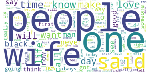
(b) Word cloud of examples with offense rating < 2