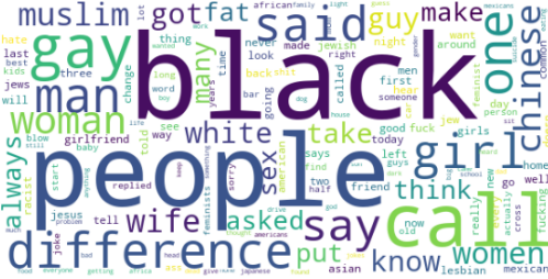
(a) Word cloud of examples with offense rating \geq 2