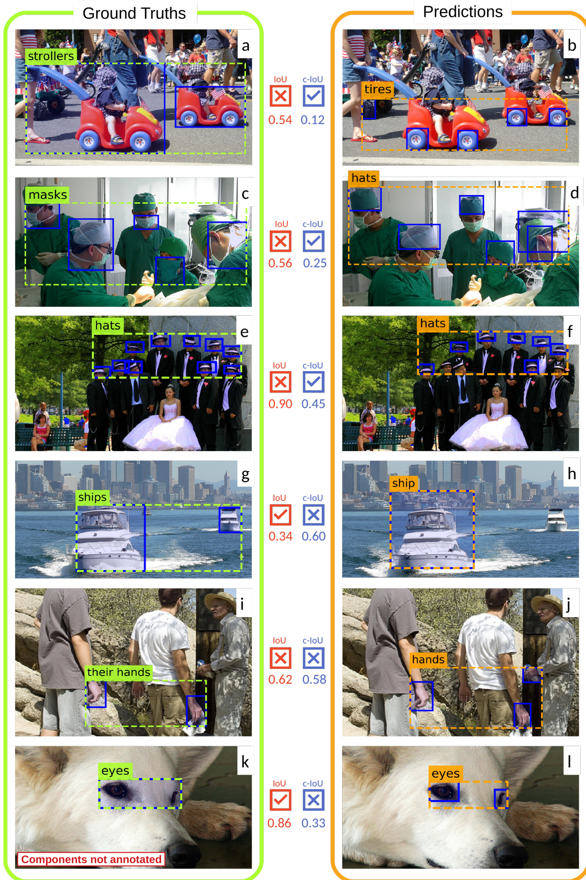
Figure 3: GT and prediction cases with union boxes (dashed) and components (blue); the check marks show whether IoU (red) and c-IoU (blue) correctly evaluate the prediction (for further explanation see Figure 2).