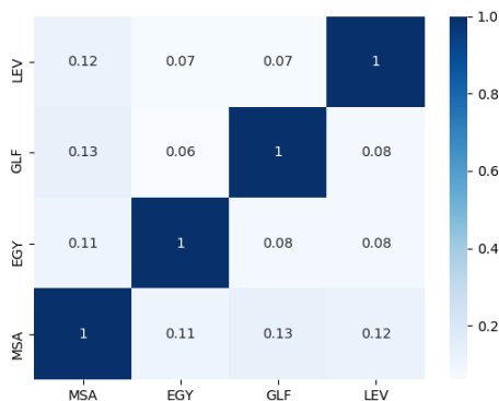
Figure 2: Heat map for shared vocabulary between different data variants