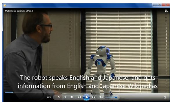
Figure 2: Annotated video of an English-Japanese language-switching robot.

An annotated video (Figure 2) of the English-Japanese language-switching demo can be seen at https://drive.google.com/open?id=0B-D1kVqPm1KdRD1kVh4Z2tUTG8 .