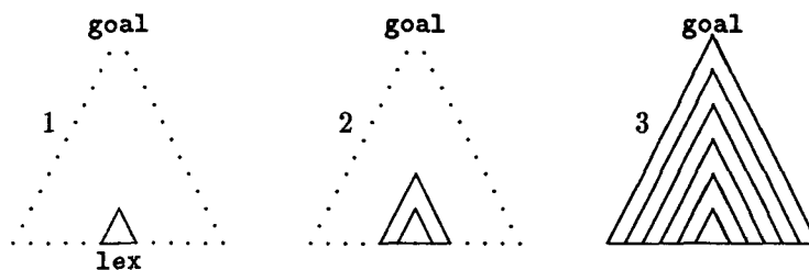
Figure 1: The head-corner parser.

that there is one daughter D_h which has been identified (by the grammar writer) as the head of that rule.