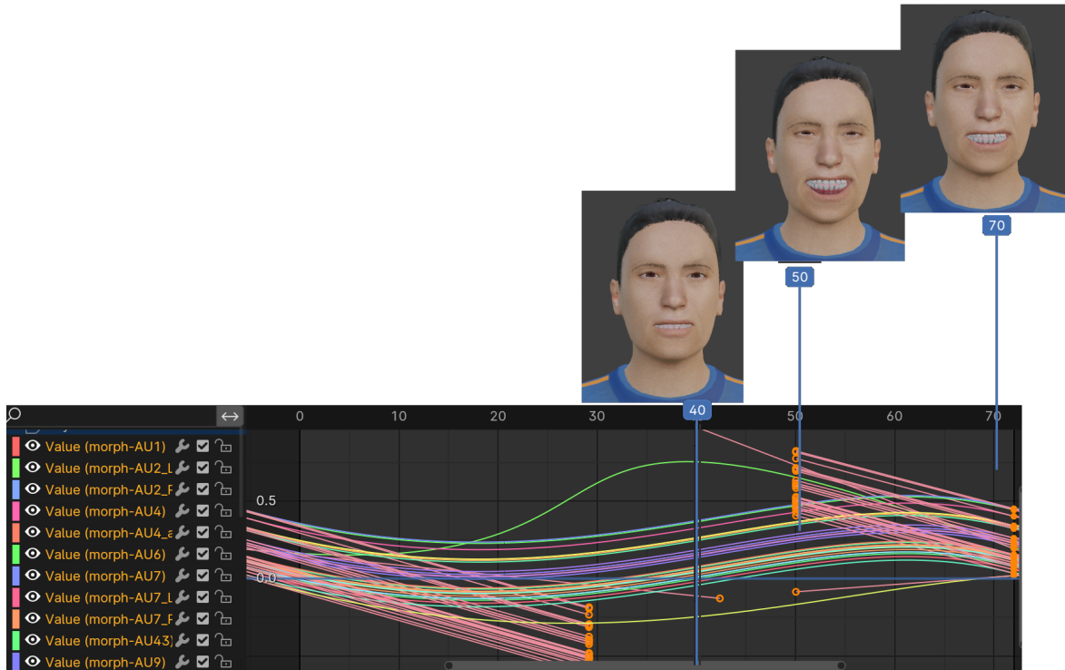
Figure 2: big-threatening based on a motion template (higher acceleration for jaw-drop)

pictures are easier to use when we try to model the face on an avatar than videos.