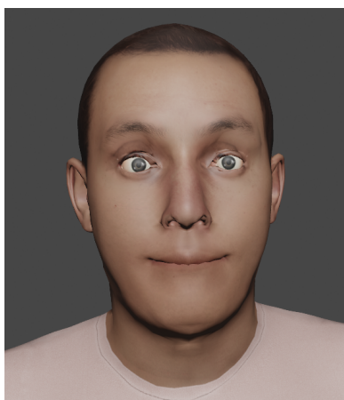
Figure 4: Better facial expressions achieved using FLAME (Li et al., 2017)

philosophy of using a template mesh but generate better facial expressions since their models also account for other parameters such as stretching of skin and underlying muscles. This is demonstrated in figure 4 where the expression was generated manually using the first 100 principle components of the FLAME model. However, this generation can be automated using a flame-compatible recognition technique such as EMOCA Daněček et al. (2022). Another potential area of improvement could be the automatic creation of motion templates from retargeted facial motion capture data, thus adding much more detail to the interpolations.