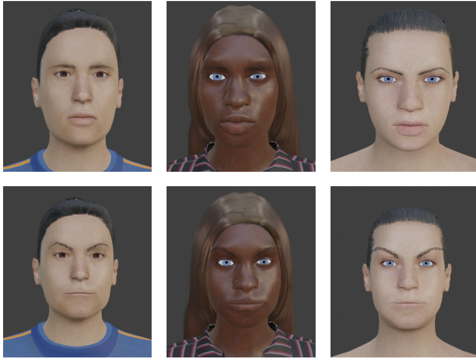
Figure 3: Synthesis of closer-look (bottom) for male, female and neutral gender and their neutral expression for reference (top)

avatar’s ability to perform a wide range of AUs and the synthesis of the modeled facial expressions. The accompanying videos of this research can be found at https://doi.org/10.5281/zenodo.10912305 . Video “all_action_units” demonstrates the full range of AUs synthesized by our avatar. Video “all_expressions” shows all the synthesized expressions based on the French Sign Language corpus (Challant and Filhol, 2024). Figure 3 illustrates the synthesis of the expression closer-look across avatars of different genders, showcasing our method’s adaptability to various avatar designs. Additionally, video “big_threatening_hot” demonstrates the expression big-threatening(hot()) and hot() alone without non-manuals illustrating the added depth and meaning when non-manual signals are incorporated.