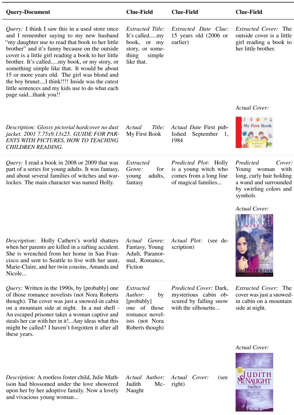
Table 2: Query-document pairs, their generated sub-queries or clues , and corresponding gold document fields. Clues can be extracted directly from the query or predicted as a best-guess attempt to match the actual document field. Clues can be about the book’s title, author, date, cover, genre, or general plot elements.