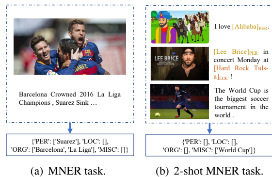
Figure 1: Illustration of MNER and 2-shot MNER tasks.

"Suarez" (PER), "Barcelona" and "La Liga" (ORG), to finish the MNER task. Most existing methods commonly employ pre-trained models followed by fine-tuning to accomplish the MNER task and achieve superior performance (Lu et al., 2018; Yu et al., 2020; Zhang et al., 2021; Chen et al., 2022b). In terms of existing research efforts, their superior performance generally relies on sufficient annotated data, which is time-consuming and labor-intensive. In addition, in practice, entity categories will continue to emerge rather than remain fixed. Therefore, it is impractical to define all entity categories in advance.