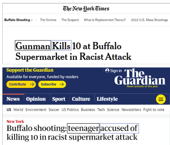
Figure 1: Framing devices deployed in the headlines of two news reports published by The New York Times and The Guardian on the 2022 Buffalo mass shooting.

rally compared to those who read the public order news story (Nelson et al., 1997, p. 581). Figure 1 shows similar frames deployed in two news headlines on the 2022 Buffalo mass shooting.