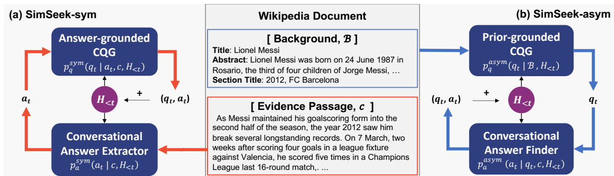
Figure 2: Overview of our frameworks continuing the held-out conversation \mathcal{H}_{<t} . To generate a QA pair (q_t, a_t) at current turn t , (a) SIMSEEK-SYM first extracts the answer candidate a_t from the passage c . Then, the questioner generates question q_t that can be answered by a_t . (b) SIMSEEK-ASYM first asks a follow-up question without accessing the passage. The answerer then provides an answer to the question from the evidence passage. Finally, we append the resulting QA pairs to the history \mathcal{H}_{<t} for moving on to the next turn.