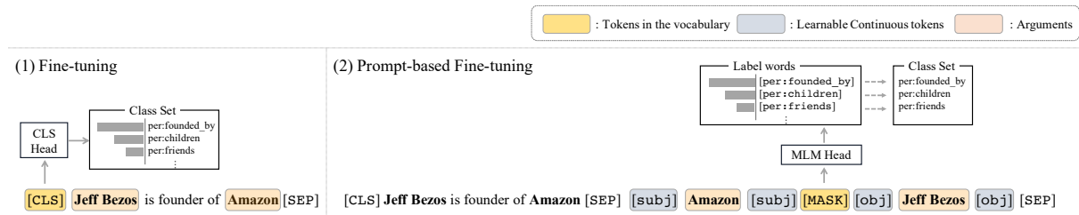
Figure 1: An illustration of (1) standard fine-tuning approach, and (2) prompt-based fine-tuning approach. In prompt-based fine-tuning approach, a set of label words are mapped into a class set by a certain mapping function.

to bridge the gap between pre-training and fine-tuning (Gao et al., 2020; Han et al., 2021). As presented in Figure 1, prompt-based fine-tuning treats the downstream task as a masked language modeling (MLM) problem by directly generating the textual response to a given template. In specific, prompt-based fine-tuning updates the original input on the basis of the template and predicts the label words with the [MASK] token. Afterwards, the model maps predicted label words to corresponding task-specific class sets.