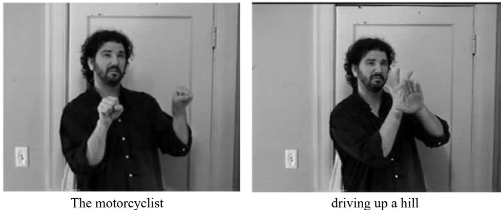
Figure 1. Classifier usage (Dudis, 2004).

can be used to describe the size and shape of an object, and they can also represent how an object moves or is utilized. Through the use of classifiers, a signer can describe a scenario with few discrete lexical items. The signer creates an image in space. This is not simply an informal gesture as there are well-documented linguistic rules governing classifier usage (Lepic & Occhino, 2018). These are evocative, not necessarily iconic, and are extremely powerful. In a story about a motorcycle ride (Dudis, 2004), a signer can use an instrument classifier to indicate that the rider is revving the engine and a vehicle classifier to show the rider driving away on a hilly highway (Figure 1).