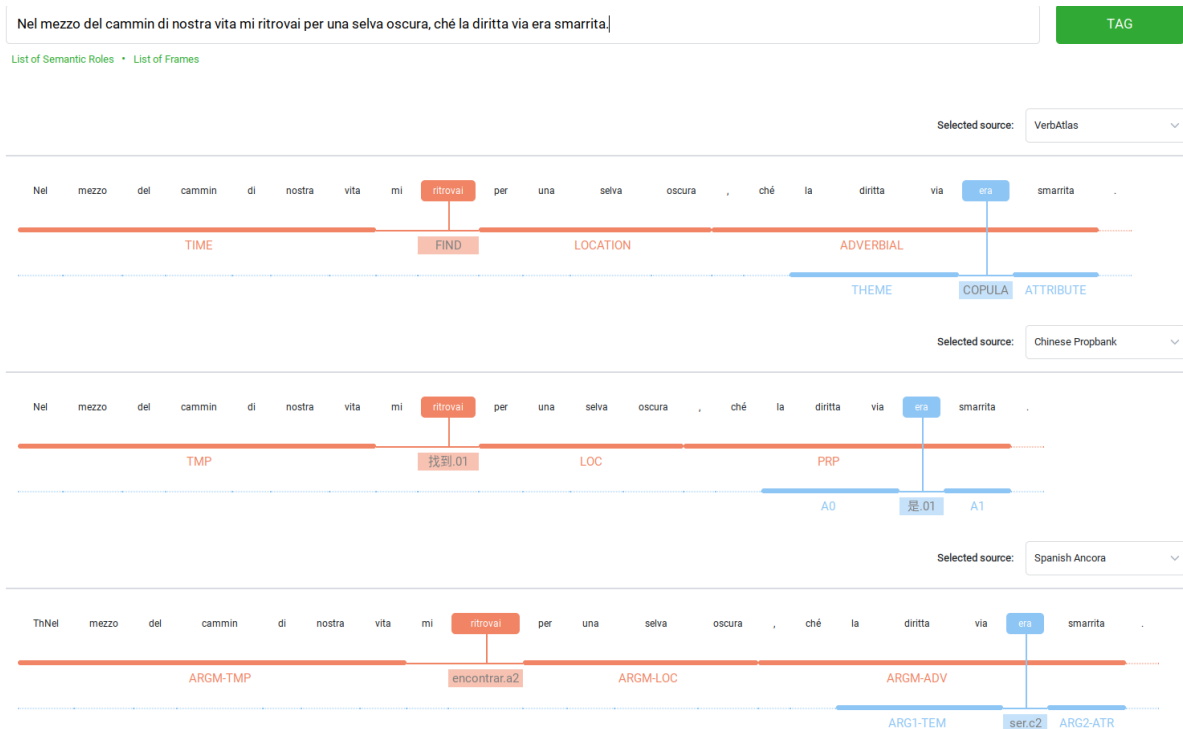
Figure 3: The beginning of the Divine Comedy by Dante Alighieri in Italian as tagged by InVeRo-XL with three predicate-argument structure inventories – VerbAtlas, the Chinese PropBank and the Spanish AnCoro. “Nel mezzo del cammin di nostra vista mi ritrovai per una selva oscura, ché la diritta via era smarrita” translates into “Midway upon the journey of our life I found myself within a forest dark, for the straightforward pathway had been lost”.

tic roles as provided by InVeRo-XL. Thanks to a dropdown menu, users can immediately switch from the labels of one inventory to those of another, independently of the input language, without reloading the Web page. We argue that this Web interface should help teachers explain SRL to their students, allow linguists to compare linguistic inventories on particular case studies, attract new researchers to the field, and inspire others to exploit SRL in downstream tasks or even real-world scenarios.