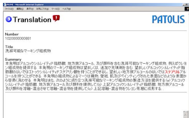
Figure 3: Example of KJ document translation.

In addition, for words unlisted in the Cross Language's dictionary, transliteration is performed to identify phonetic equivalents in the target language. It is highly effective specifically in processing loanwords spelled out by Japanese phonetic alphabets (i.e., katakana ).