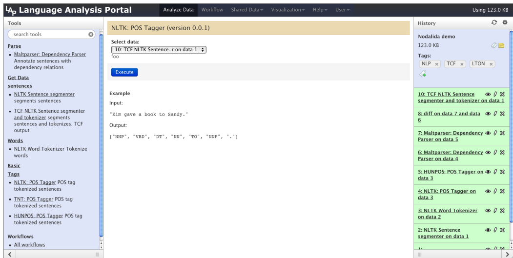
Figure 1: A screenshot of the current implementation of LAP within Galaxy. The left panel displays the installed tools, the center panel shows the currently selected function and the right panel hosts the file history.

have exponential worst-case complexity. At the same time, typical language analysis tasks can be trivially parallelized, as processing separate documents (and for many tasks also individual sentences) constitute independent units of computation. The fact that the portal will submit the sub-tasks of a workflow to an underlying HPC cluster—without the need for user knowledge about job scheduling etc.—means that the user will be able to perform analyses that might otherwise not be possible (and faster and on larger data sets).