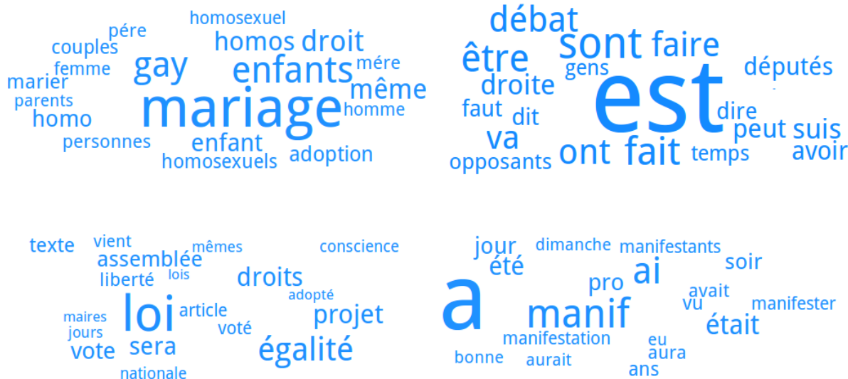
Figure 1: A cloud-style representation of words distribution in the TW-MPT dataset. It includes four sections respectively showing (from left to right and from top to bottom) the more used words for the following semantic areas: family, socio-political debate, legal aspects, public manifestations.