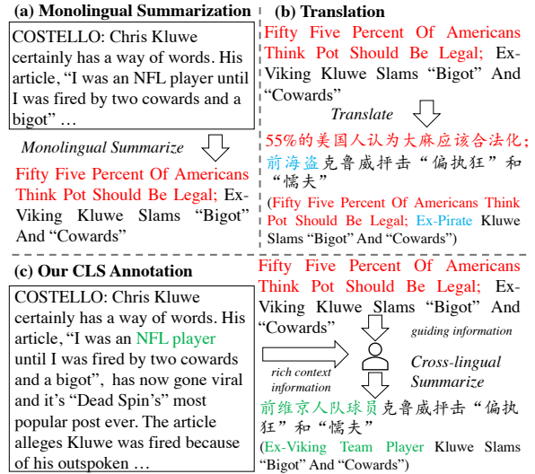
Figure 1: An En-Zh summary from Wang et al. (2022a) (best viewed in color). We compare “pipeline: (a)→(b)” annotation protocol and our annotation (c) protocol. Pipeline annotation results in errors from both summarization (red: unmentioned content/hallucination) and translation (cyan: incorrect translation) processes. To address this issue, we explicitly annotate target-language summaries with faithfulness rectification (green) based on input context, with the guidance of mono-lingual summaries.

With the advance in deep learning and pre-trained language models (PLMs) (Devlin et al., 2019; Lewis et al., 2020; Raffel et al., 2020), much recent progress has been made in text summarization (Liu and Lapata, 2019; Zhong et al., 2022a; Chen et al., 2022a). However, most work focuses on English (En) data (Zhong et al., 2021; Gliwa et al., 2019; Chen et al., 2021), which does not consider cross-lingual sources for summarization (Wang et al., 2022b). To address this limitation, cross-lingual summarization (CLS) aims to generate summaries in a target language given texts from a source language (Zhu et al., 2019), which has shown values