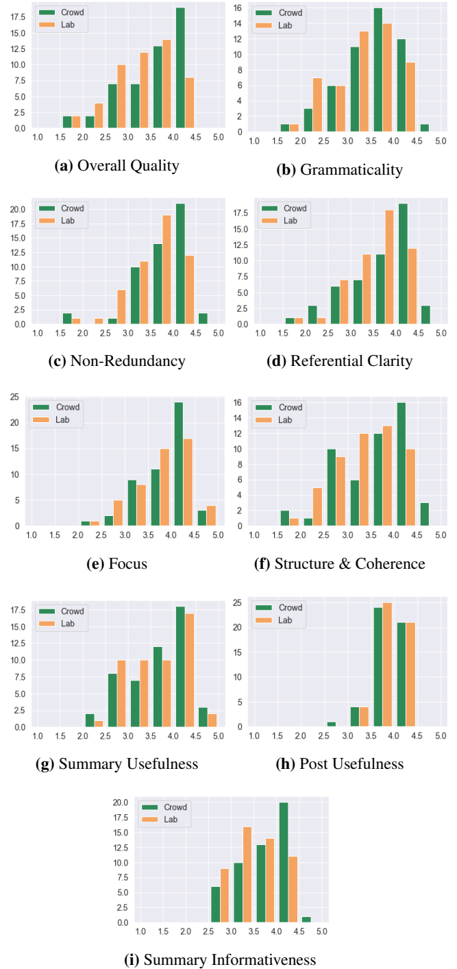
Figure 2: Histogram of Crowd (green) and Laboratory (orange) Ratings

Results are presented for the scores overall quality (OQ), the five intrinsic quality scores (including grammaticality