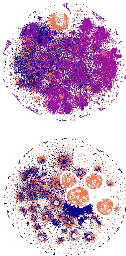
Figure 2: T-SNE comparison of synset embeddings for whole WordNet learned from SC+UWA10 (top), or just SC (bottom). Colors represent source of annotations for embeddings (● SC ● UWA ● Propagation).

tem that propagates sense embeddings across WordNet, we have shown that these unambiguous words provide an excellent bridge to reach a wider range of OOV senses. This translates, in turn, into improving results for WSD. For future work it would be interesting to test these sense embeddings in a wider range of applications outside WSD. Since the embedding space is clearly more diversified, as shown in Figure 2, this may lead to improvements in other downstream tasks.