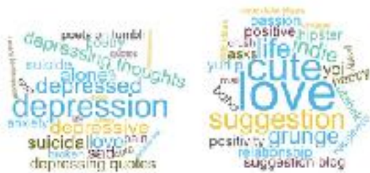
(a) (b) Figure 4.4 Tag Clouds Generated from the Top 25 Tags Used by (a) Depressed and (b) Non-Depressed Users

On the other hand, non-depressed users do not have any of the 20 tags that the study used in order to retrieve the potential respondents. The tags are rarely used and are overpowered by the tags found in Figure 4.4b that they are frequently using. Non-depressed users often use depression-associated tags within their posts encouraging depressed users to seek help or when only a limited number of posts are aimed at depression. Some of these non-depressed users may be only mildly depressed depending on the scores of both PHQ-2 and CESD-R questionnaires.