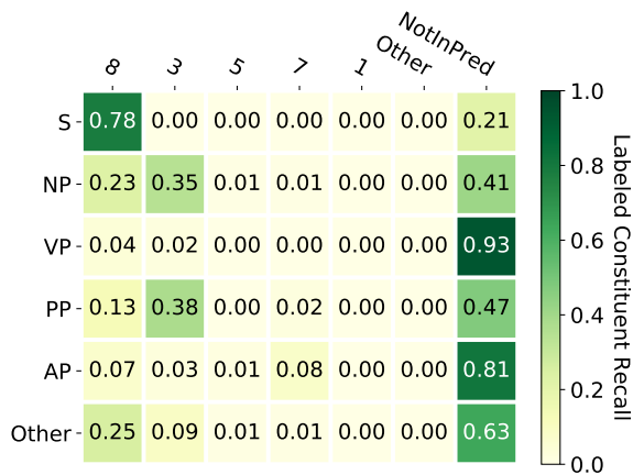
(a) the DIMI system.