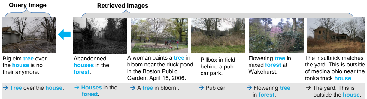
Figure 3: Example Image Caption Transfer