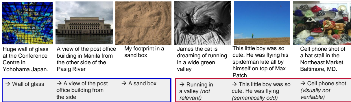
Figure 4: Good (left three, in blue) and bad examples (right three, in red) of generalized captions

ages in the whole dataset using an unweighted sum of gist similarity and tiny image similarity.