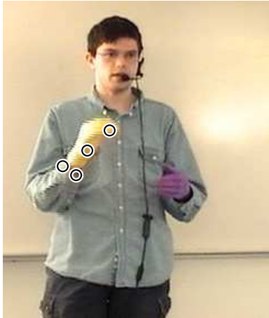
Figure 2: Circles indicate the interest points extracted from this frame of the corpus.

This visual feature representation is substantially lower-level than the descriptions of gesture form found in both the psychology and computer science literatures. For example, when manually annotating gesture, it is common to employ a taxonomy of hand shapes and trajectories, and to describe the location with respect to the body and head (McNeill, 1992; Martell, 2005). Working with automatic hand tracking, Quek (2003) automatically computes perceptually-salient gesture features, such as symmetric motion and oscillatory repetitions.