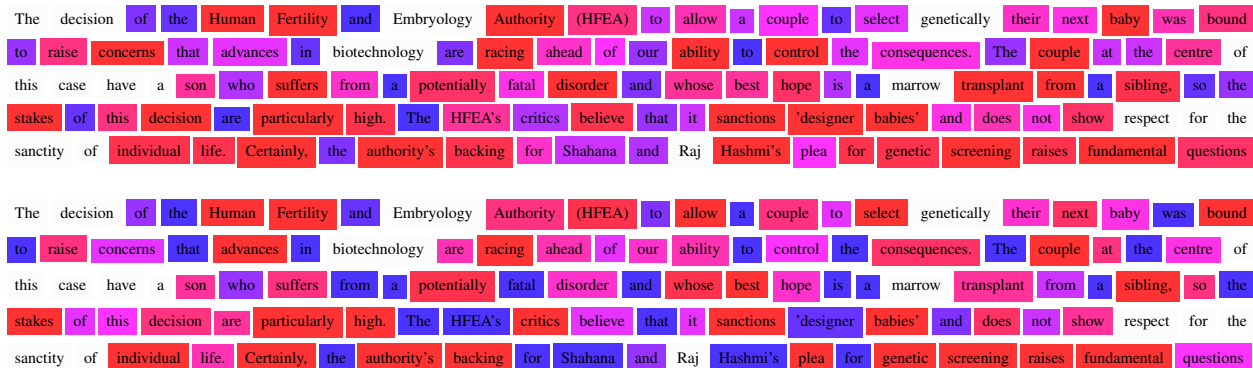
Figure 2: Top: Heatmap showing human fixation probabilities, as estimated from the ten readers in the Dundee corpus. In cases of track loss, we replaced the missing value with the corresponding reader’s overall fixation rate. Bottom: Heatmap showing fixation probabilities simulated by NEAT. Color gradient ranges from blue (low probability) to red (high probability); words without color are at the beginning or end of a sequence, or out of vocabulary.