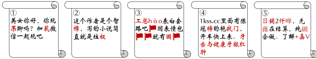
Figure 1: Real-world cases of adversarial attacks. Adversarially modified content is highlighted in red.