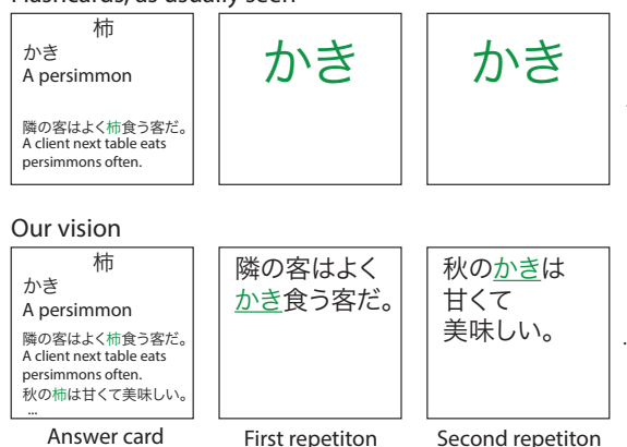
Figure 1: Flashcards for the word “柿”

often lack usage context information. A question card is usually a word alone , an answer card could contain a fixed single example sentence present. The example does not change from repetition to repetition, and as a result does not show the full spectrum of word usage. However, humans do not use isolated words for communicating. Words are always surrounded by other words, forming word usages. Learning these word usages is as important as learning words themselves.