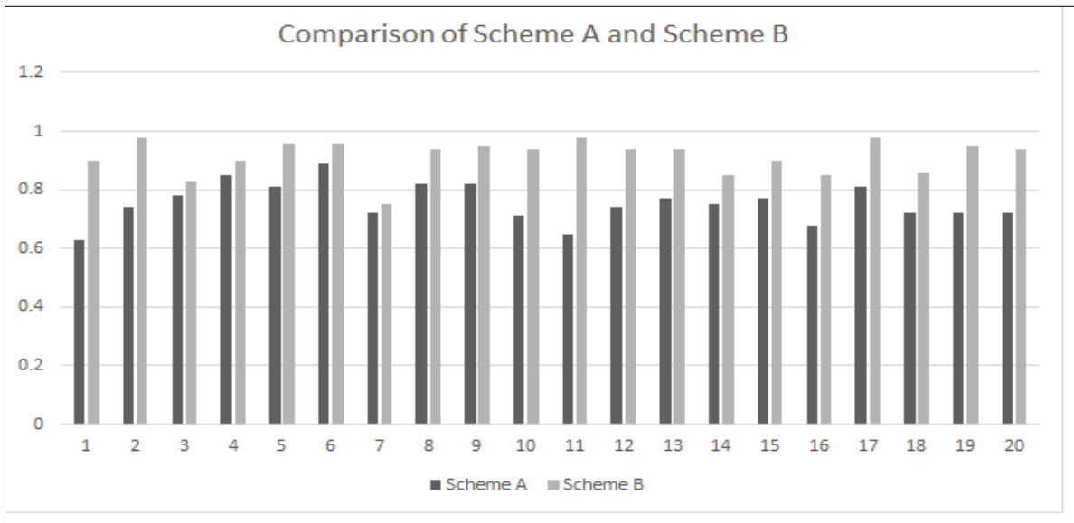
Figure 3: Comparison of results in Scheme A and Scheme B.

Networks. In Proceedings of the 3rd Annual ACM Web Science Conference , ACM, pages. 298-307.