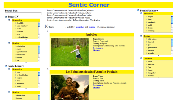
Figure 4: Sentic Corner web interface

Among these, ‘happy’ and ‘sad’ posts were identified with particularly high precision (89% and 81% respectively) and decorous recall rates (76% and 68%). The F-measure values obtained, hence, were significantly good (82% and 74% respectively), especially if compared to the corresponding F-measure rates of the baseline methods (53% and 51% for keyword spotting, 63% and 58% for lexical affinity, 69% and 62% for statis-