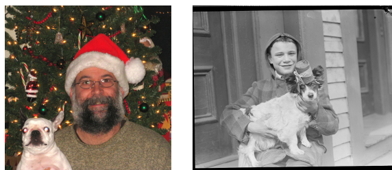
a man wearing a santa hat holding a dog posing for a picture

In this paper, we present a novel query expansion approach for image captioning, in which we utilize a distributional model of meaning for sentences. Extensive experimental results on three well-established benchmark datasets have demonstrated that our approach outperforms the state-of-the-art data-driven approaches. Our future plans focus on incorporating other cues in images, and