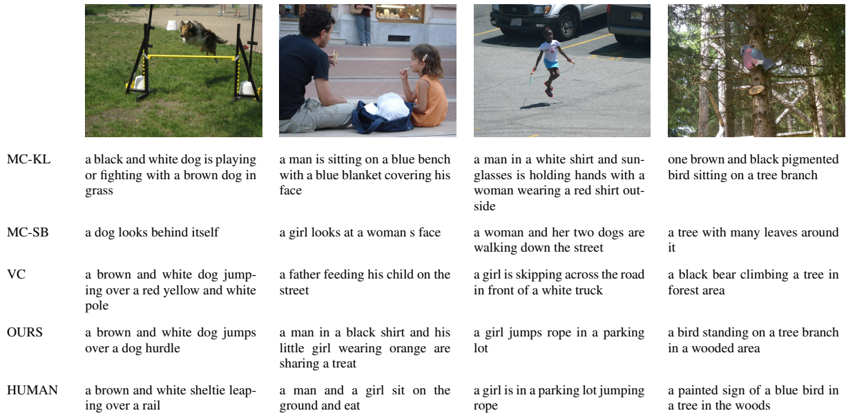
Figure 2: Some example input images and the generated descriptions.