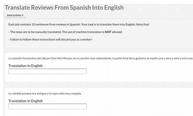
Figure 2: Screenshot of the translation task in CrowdFlower

Once the settings are in place, we would prepare the task detailing the instructions for contributors, as shown in Figure 2. Subsequently, we would launch the task.