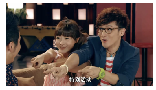
(Caption) Actors: Special Events.

However, most of the existing research mainly used textual modality to recognize conversational