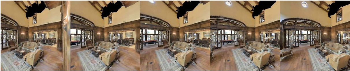
Figure 4: Example of a sequence of images, the question, the predicted answer and the ground-truth answer.

Question: what color is the sofa in the living room ? Prediction: tan Ground truth: yellow