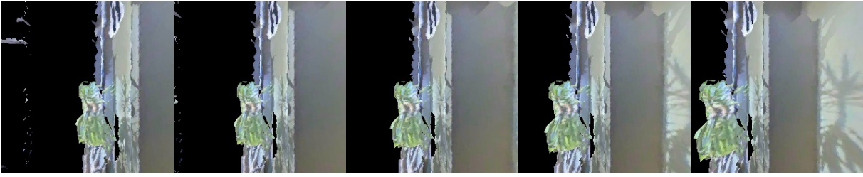
Figure 3: Example of a badly rendered scene from the EQA dataset.

Question: what color is the plant in the kitchen ? Prediction: olive green Ground truth: green