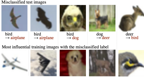
Figure 5: Misclassified images in the validation set (upper row) and images with the highest influence in the training set (lower row) for VGGNet on CIFAR-10.