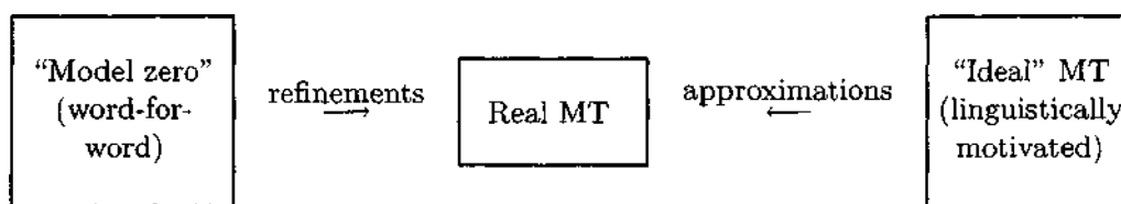
Figure 3: Real MT seen both as a refinement of a word-for-word model and as an approximation to an ideal, linguistically motivated, compositional model.