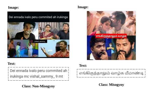
Figure 1: Example of a misogynistic and a nonmisogynistic meme in Tamil

2024), (Srivastava, 2022), (Mulki and Ghanem, 2021), (Mahdaouy et al., 2022), leveraging large-scale datasets and advanced techniques and models. However, research in low-resource languages such as Tamil and Malayalam has been scarce (Ra-jalakshmi et al., 2023), (Ghanghor et al., 2021), (Chakravarthi et al., 2024), leaving a significant gap in addressing this issue in multilingual and diverse online communities.