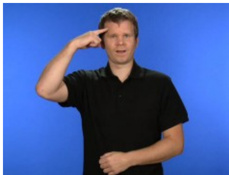
Figure 1: The SSL sign THINK (Svenskt teckenspråkslexikon, 2016).

Signed language uses the other of the two natural modalities of human language, being visual-gestural instead of auditive-oral. A key difference