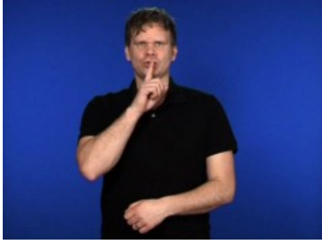
Figure 2: The SSL sign QUIET (Svenskt teckenspråkslexikon, 2016).