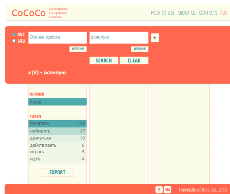
Figure 2: On-line interface.

Currently we use two corpora: a (manually) morphologically disambiguated sub-corpus of the Russian National Corpus (Rakhlina, 2005) and the Russian Internet Corpus (Sharoff and Nivre, 2011). The former contains approximately 6 million tokens; from this corpus it is possible to get