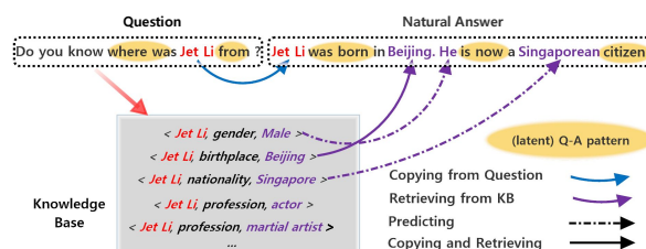
Figure 1: Incorporating copying and retrieving mechanisms in generating a natural answer.

However, in real-world environments, most people prefer the correct answer replied with a more natural way. For example, most existing