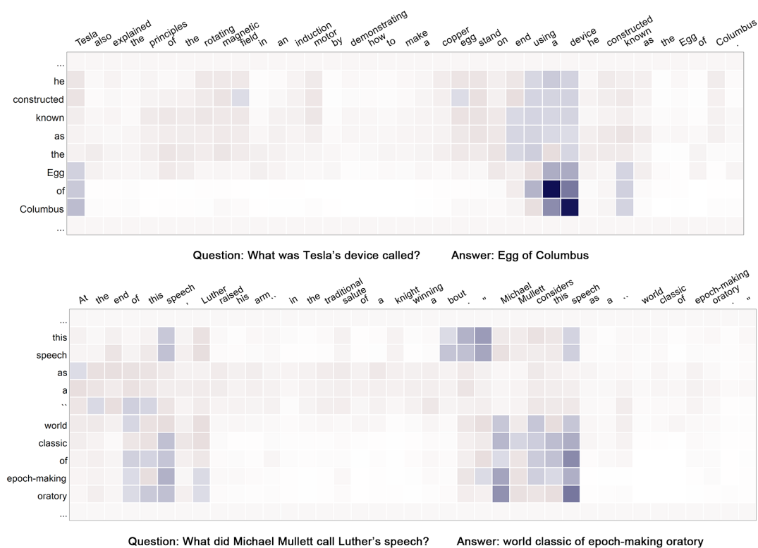
Figure 2: Part of the attention matrices for self-matching. Each row is the attention weights of the whole passage for the current passage word. The darker the color is the higher the weight is. Some key evidence relevant to the question-passage tuple is more encoded into answer candidates.

attention-based recurrent network (GARNN) and self-matching attention mechanism positively contribute to the final results of gated self-matching networks. Removing self-matching results in 3.5 point EM drop, which reveals that information in the passage plays an important role. Character-level embeddings contribute towards the model’s performance since it can better handle out-of-vocab or rare words. To show the effectiveness of GARNN for variant RNNs, we conduct experiments on the base model (Wang and Jiang, 2016b) of different variant RNNs. The base model match the question and passage via a variant of attention-based recurrent network (Wang and Jiang, 2016a), and employ pointer networks to predict the answer. Character-level embeddings are not utilized. As shown in Table 4, the gate introduced in question and passage matching layer is helpful for both GRU and LSTM on the SQuAD dataset.