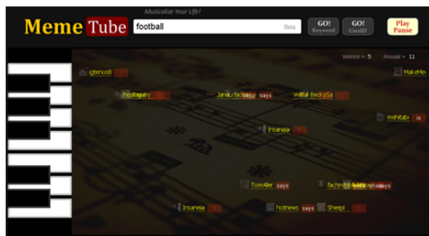
Figure 2: A snapshot of the proposed MemeTube.

nation (based on the arousal value). For chord set selection, we design nine basic chord sets as {A, Am, Bm, C, D, Dm, Em, F, G}, where each chord set consists of some basic notes. The chord sets are used to compose twenty chord sequences. Half of the chord sequences are used for weakly positive to strongly positive sentiments and the other half are used for weakly negative to strongly negative sentiments. The valence value is therefore divided into twenty levels, and gradually shifts from strongly positive to strongly negative. The chord sets ensure that the resulting auditory presentation is in harmony (Hewitt 2008). For rhythm determination, we divide the arousal values into five levels to decide the tempo/speed of the music. Higher arousal values generate music with a faster tempo while lower ones lead to slow and easy-listening music.