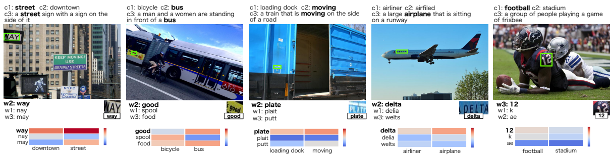
Figure 2: Examples of candidate re-ranking using object (c1), place (c2), and caption (c3) information. The three left examples are re-ranked based on the semantic relatedness score. The delta-airliner relation which frequently co-occurs in training data is captured by the overlap layers . The 12-football pair shows a relatedness between sports and numbers.

cific points in the sequence when computing its output. However, in this case, the attention attends the wrong context, as there are many words have no correlation or do not correspond to actual words. On the other hand, USE-T seems to require a shorter hypothesis list to get top performance when the right word is in the hypothesis list.