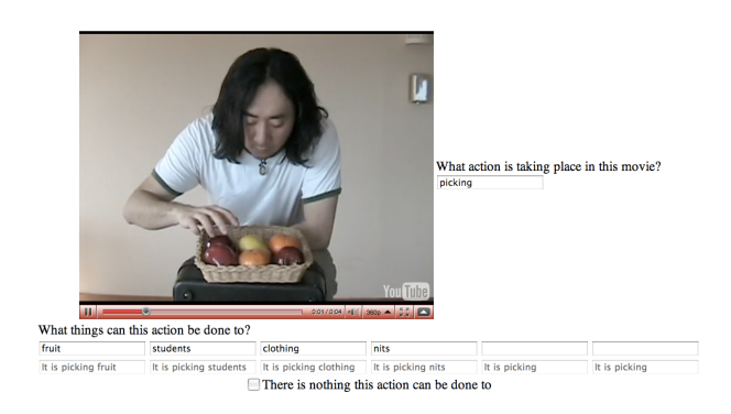
Figure 2: A screenshot of a user completing a task to find objects of a particular verb, where the verb is represented by a film. After the user has written a verb and a noun, a protosentence is formed and shown to ensure that the user is using the words in the appropriate roles.

input (Figure 2). This helped ensure consistent answers. The subject and object tasks were done separately, and for the object task, users were allowed to say that there is nothing the action can be done to (for example, for an intransitive verb).