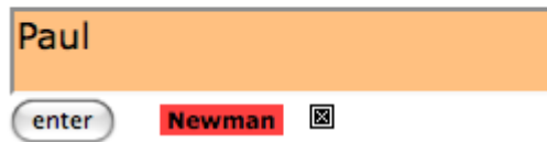
Figure 1: Interactive Machine Translation. Caitra uses the search graph of the machine translation decoder to suggest words and phrases to continue the translation.

the translation word by word, she is aided by a machine translation system that interactively makes suggestions for completing the sentence, and updates these suggestions based on user input. The scenario is very similar to the auto-completion function for words, search terms, email addresses, etc. in modern office applications.