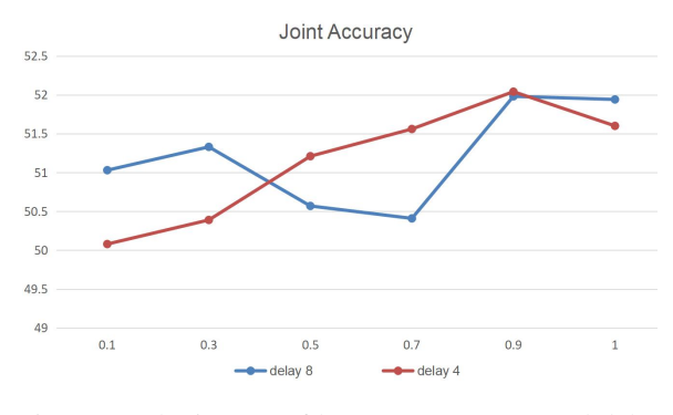
Figure 2: The impact of hyper-parameter \alpha and delay update step on DST joint accuracy.