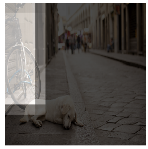
(b) Caption: "a bicycle parked in front of a bicycle"