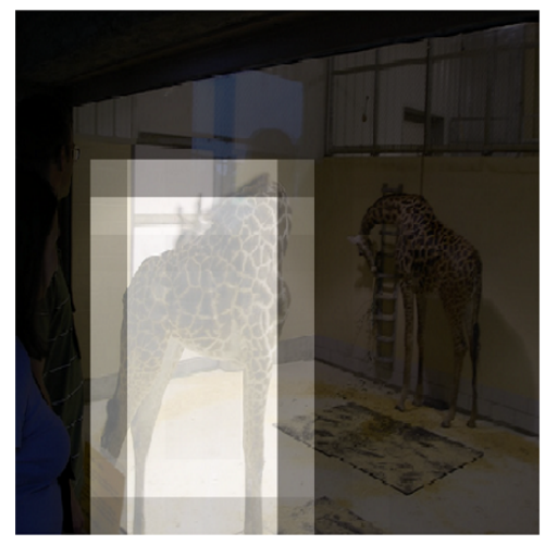
(b) Caption: "a giraffe standing in a pen with a giraffe"