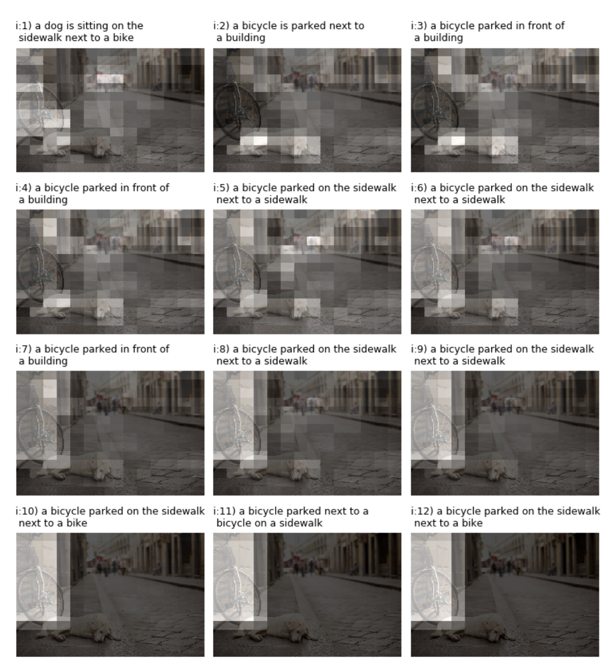
Figure 4: The limited step-wise fixed attention for the sample image with the dog and the bike. The number of fixed time-steps is increasing from the left-upper corner to the bottom-right corner from 1 to 12. The similarity with unlimited fixed attention is visible for more than nine fixed time-steps, while less than three time steps fixed are more similar to the alternating self-attention.