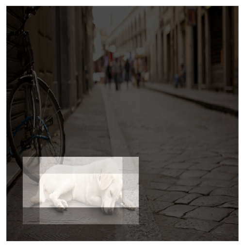
(a) Caption: "a dog is laying down on the street"