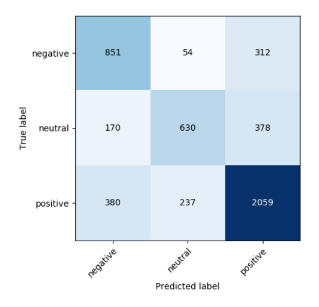
Figure 2: Confusion matrix for best performed model on Twitter dataset.

As we can observe, most mislabeled predictions are concerned with positive labels, where our model did not predict positive label or predicted it incorrectly. We performed also additional error analysis, where we looked for mislabeled tweets. After further analysis, we observed that many positively labeled tweets do not contain any sign of positive words and label was assigned due to additional information in link attached in tweet itself. This type of labeling dost not enable sentiment classification based only on textual data itself. Another observed problem could be considered labeling tweets based on real world context (e.g. political situation, twitter responses etc.), which was not provided. We suppose described problems caused significantly lower performance on Twitter dataset, since we tackled only problem of sentiment classification on texts themselves without utilizing any additional information. We believe there will be need for further manual evaluation to identify limits of human performance for this kind of dataset.